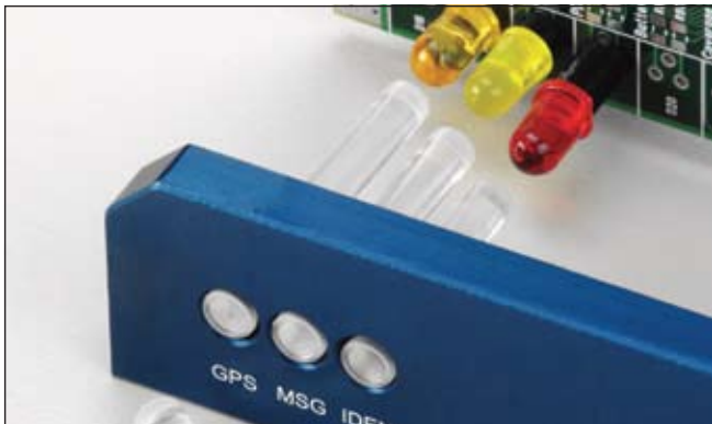
U.S. & Foreign Patents Issued and Pending