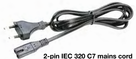
2-pin IEC 320 C7 mains cord 1800 mm EU part no. 131306 UK part no. 131148, US part no. 131147, AU part no. 013108